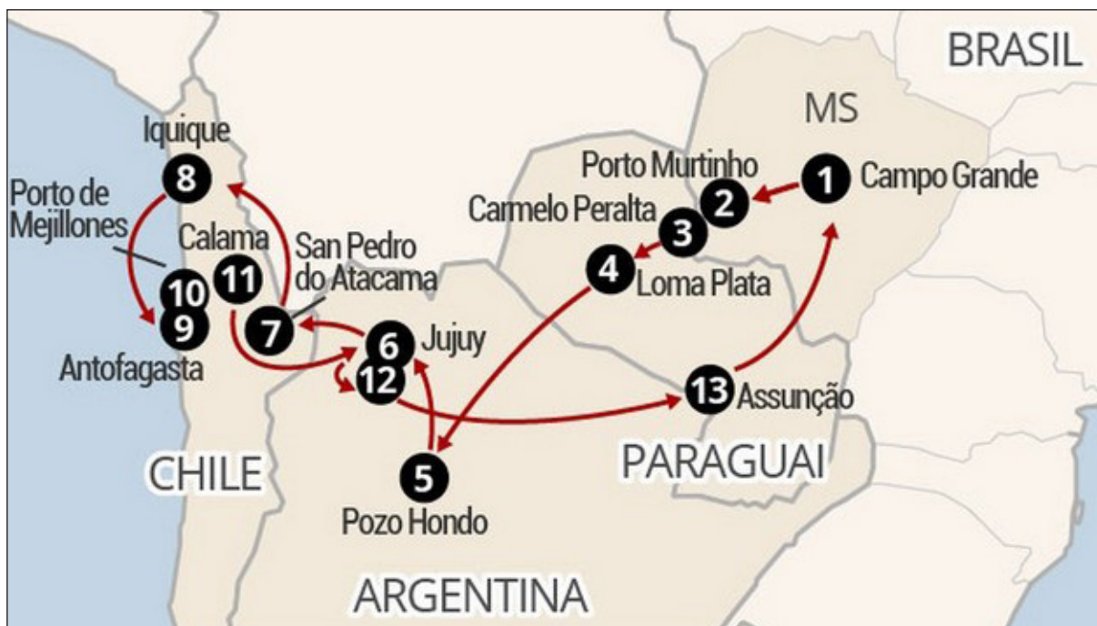
Figure 1 – Path of the Latin American Integration Route (RILA)